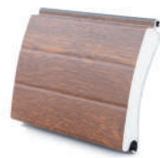
*Golden Oak Laminate