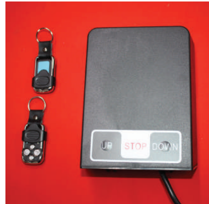
Control Box 1

We are proud to be associated with Somfy, one of the leading manufacturers of Electronic system and as such why not upgrade your door with a wireless safety edge device which when installed on your door will mean a sensor will monitor the door when closing for the safety of you and your family. The control panel is fitted with close, open and stop buttons for operation within the garage and a courtesy light that activates when the door is in operation.