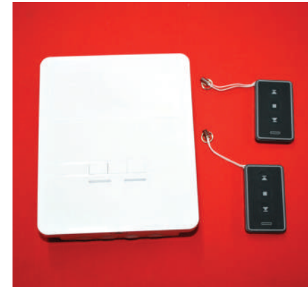
Control Box 2