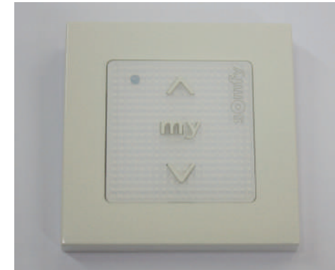
Somfy Wireless Push Button