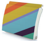
RAL colour options available