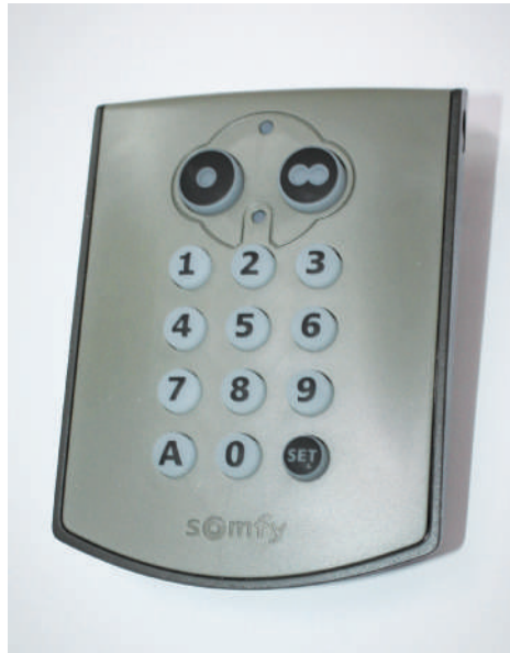
Somfy Wireless Keypad