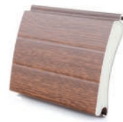
Painted Golden Oak