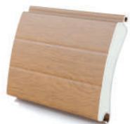
*Painted Irish Oak