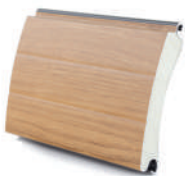
*Irish Oak Laminate