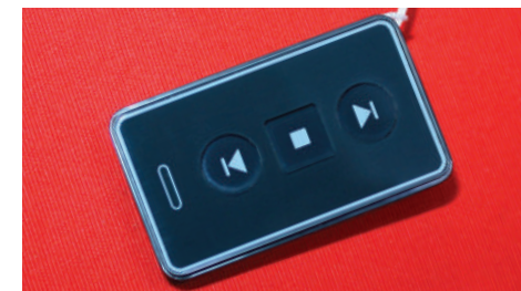
Handset (Control Box 2)