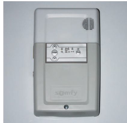
Control Box 3